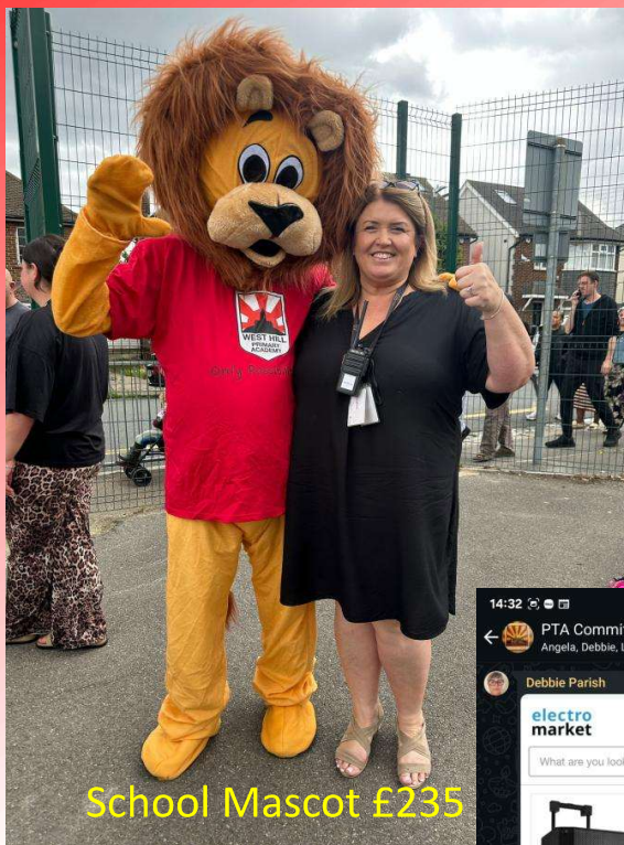
School Mascot £235