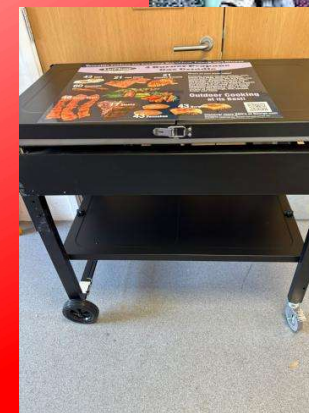
New BBQ £369