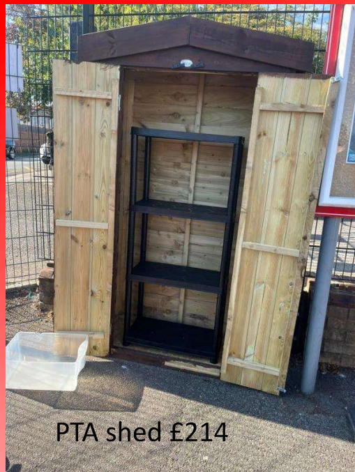
PTA shed £214