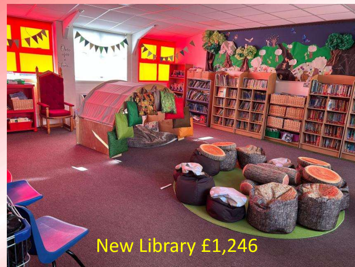
New Library £1,246