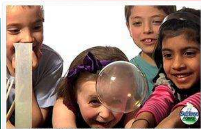
Loved by over 1 Million Children!