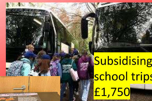
Subsidising school trips £1,750